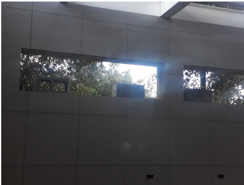
Walls in the kitchen have been plastered and floor tiles were laid.

Due to this rapid progress after the resumption of construction, it is expected that the first phase of construction will be completed no later than the end of February 2021 .