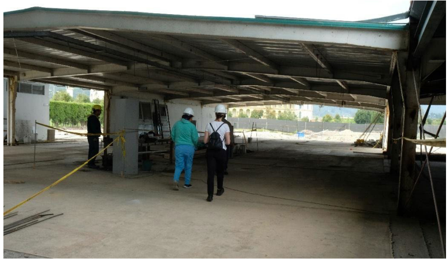
Dining room and hallway to the rooms, visit of the construction site in March 2020 .