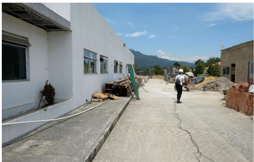
Outside area and way to the laundry building (on the right), visit of the construction site in March 2020.