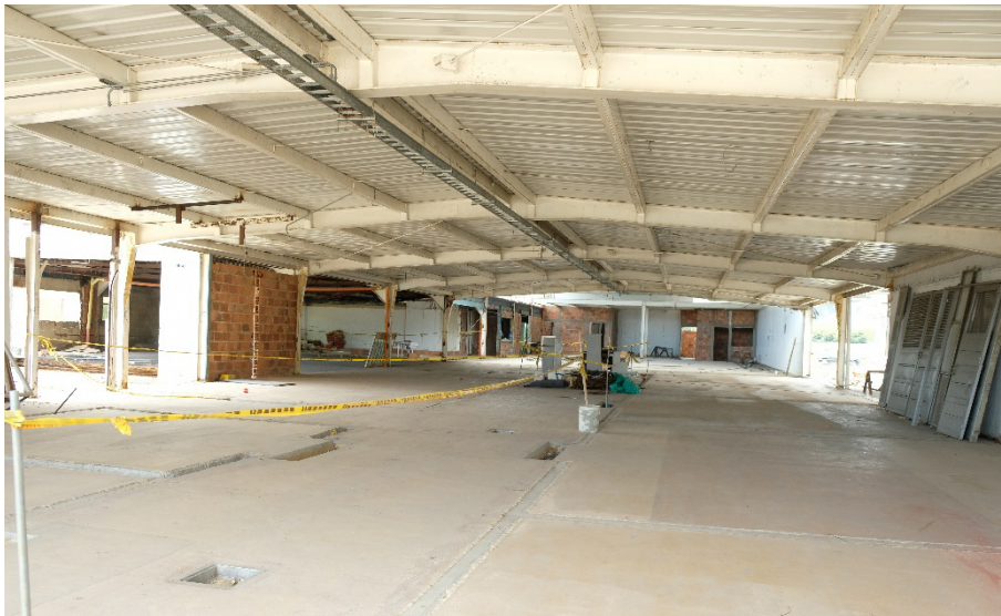
Kitchen and dining room, visit of the construction site in March 2020.