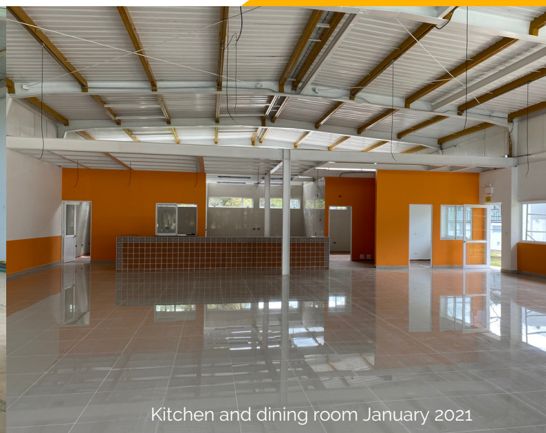
Kitchen and dining room January 2021