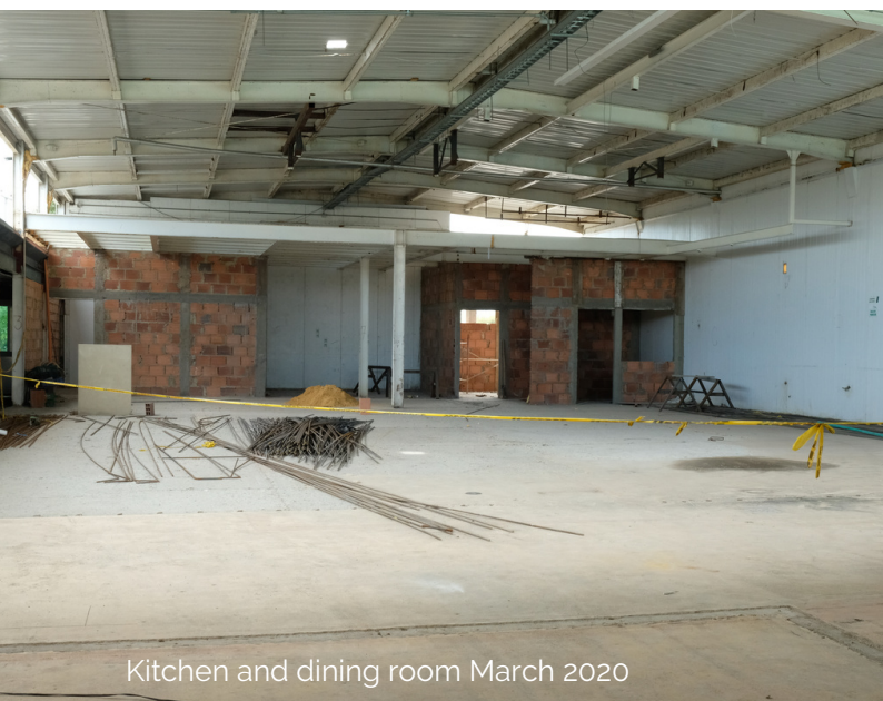
Kitchen and dining room March 2020

Every donation to the project brings us closer to the goal of building a child-friendly and barrier-free home for the children!