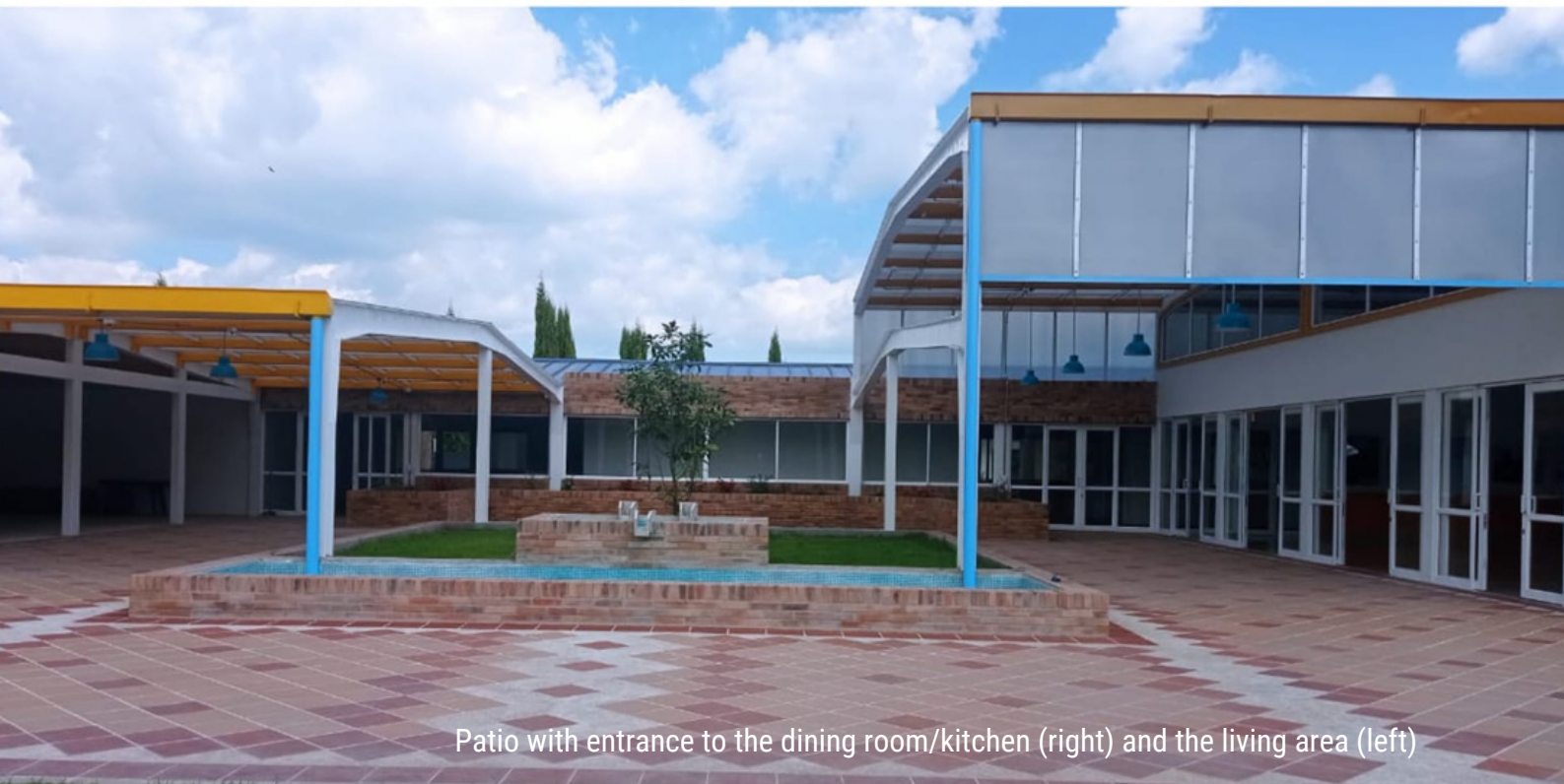
Patio with entrance to the dining room/kitchen (right) and the living area (left)