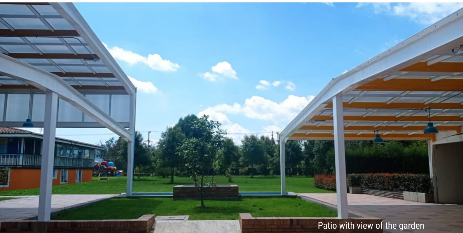
Patio with view of the garden